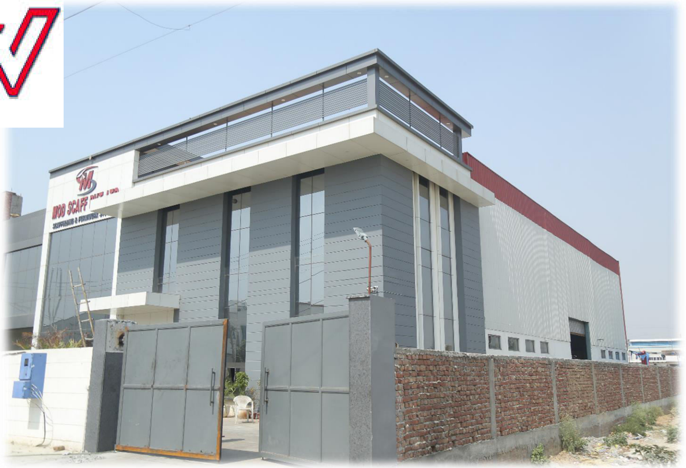
M/s. MOD SCAFF PVT. LTD.- IMT FARIDABAD AREA-8000 SQ. FT.